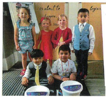
Basnett Street Nursery

Please remember to bring warm clothing and accessories now the cold weather has arrived. Children need warm coats, hats, gloves etc for when we spend time outside.